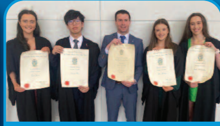
2021 UCD Entrance Scholarship Recipients